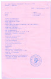
APC IJCRBP 2020-01-09002.jpg 731K