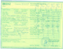
APC IJCRBP 2020-01-09001.jpg 1462K